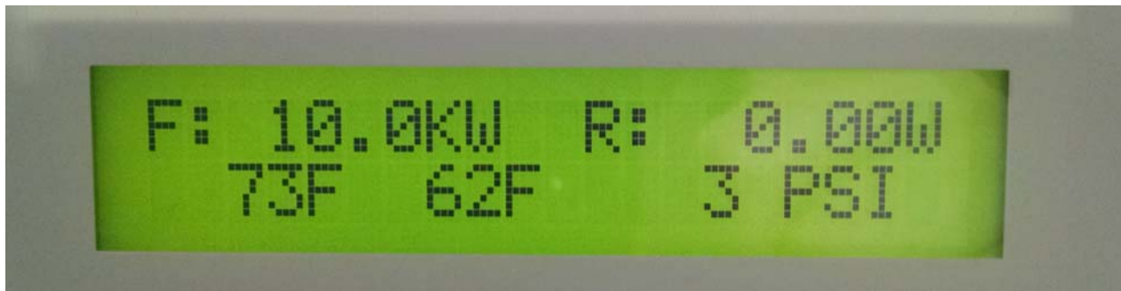
Fig. 2 RMD-100 Display showing normal indications from connected DPS-100D Power Meter

Next connect the supplied CAT 5 cable to the RMD-100 rear panel and connect the other end of this cable to the DPS-100D power meter. After making connection to the DPS-100D the RMD-100 Remote Meter Display should show this indication: