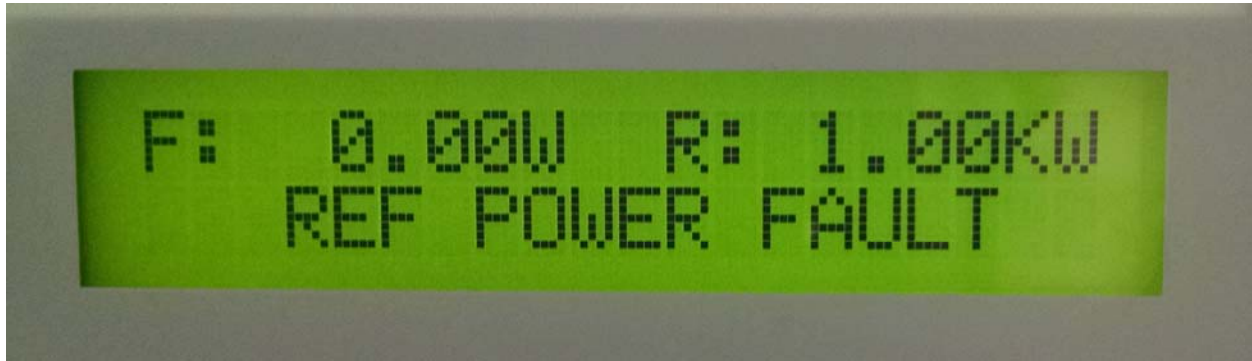
Fig. 4 Reflected Power Fault Indication

Indication of a reflected power fault will indicate as shown: