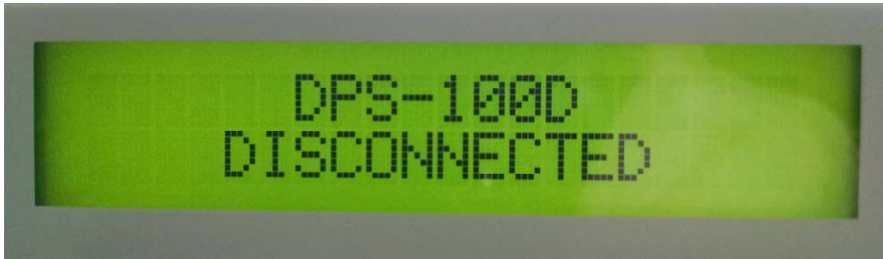
Fig. 1 RMD-100 Display showing DPS-100D Power Meter is disconnected

Choose a suitable location in any standard EIA 19" rack enclosure. It is usually a good idea to put the unit high enough to be at eye level for proper viewing of the LCD display. Once the equipment is mounted apply power the RMD-100 by plugging in the 12 VDC coaxial connector from the power pack into the rear panel 12 VDC coaxial receptacle. The unit will power up and indicate: