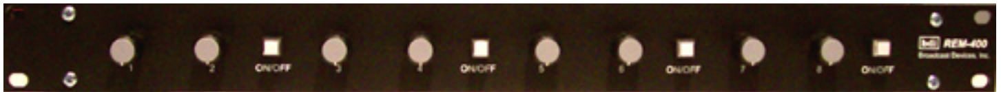
Optional REM-400 Remote Control Panel